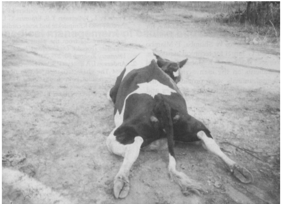
Fig. 1: Experimental animal in sternal recumbency with backward extension of the hind legs.