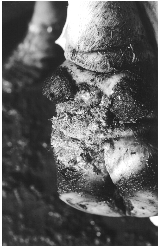
Fig. 2: Lesion with verrucose appearance (papillomatous-like).

We found that a 5 % formalin solution combined with 5 % sodium hydroxide in a foot bath (2 m long and 15 cm deep), used twice a week, resulted in a marked improvement of the condition after the 2nd treatment, and offers good control of the disease. Four weeks after the initiation of the treatment programme (a total of 8 treatments), all affected cows had completely recovered. The legs of the cows were washed clean of loose faeces and detritus before they entered the foot bath. The foot bath was cleaned weekly. The entire herd continued to receive the same treatment for 12 weeks. During the follow-up period of 1 year no new cases of digital dermatitis were recorded.