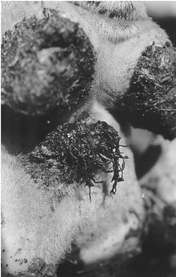
Fig. 1: Proliferative mass lesion (strawberry-like).