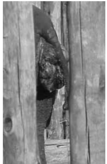
Fig. 1: Traumatised rectal mucosa of prolapsed rectum.

By the following morning the rectum had prolapsed again and there was no sign of the purse-string suture around the anus. Seventy-two hours after the initial immobilisation the rhinoceros was again immobilised, initially in a standing position, for clinical and transrectal examination. An approximately 20 cm Type 1 3 prolapse of the rectal tissue, with the mucosal and submucosal layers severely traumatised and oedematous, was confirmed. The anal sphincter tone was extremely poor, and the muscles of the tail flaccid. She was anaesthetised, went down in a sternal position and was placed on inhalation anaesthesia (Part 1). During surgery, the prolapsed tissue was resected circumferentially and anastomosed in a 2-layer fashion with no. 2 chromic catgut using a simple interrupted pattern, followed by a simple continuous pattern