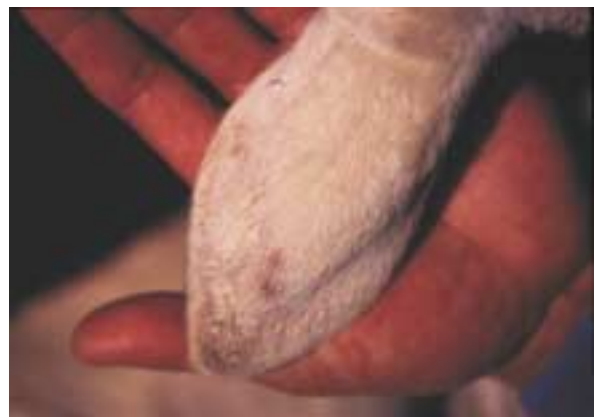
Fig. 6: Crust formation on the ear of an experimental case of Erodium moschatum photosensitisation.