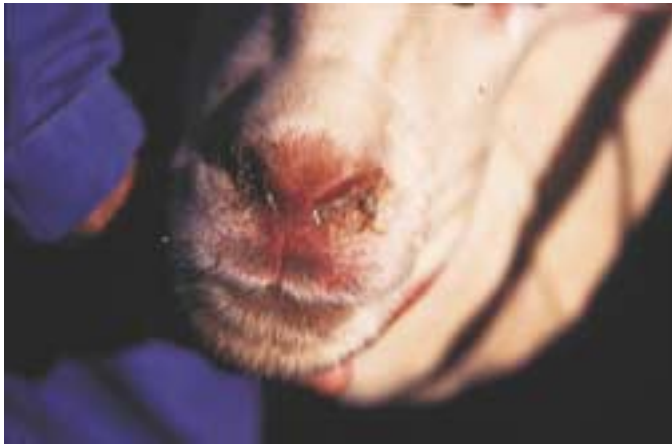
Fig. 1: Purulent crusts formed on the nasal plane of a sheep with suspected Erodium moschatum photosensitisation.