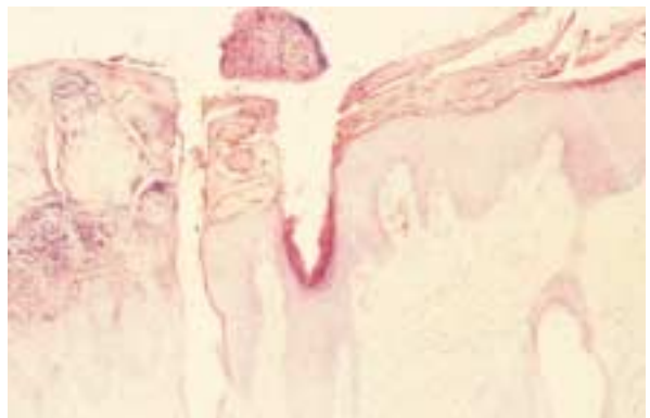
Fig. 7: Histological section of affected skin of an experimental case of Erodium moschatum photosensitisation with moderate necrotic dermatitis (H&E, x200).