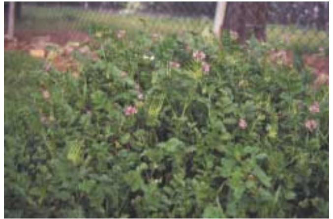
Fig. 2: Erodium moschatum .