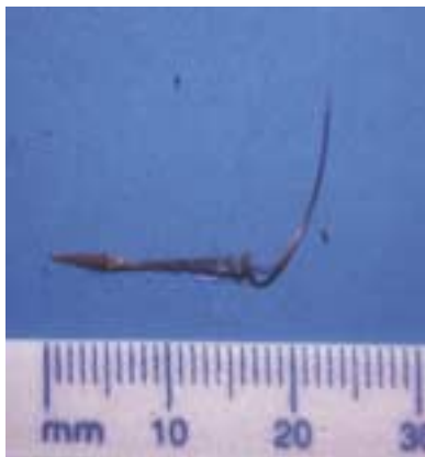
Fig. 3: Erodium moschatum : mericarp.