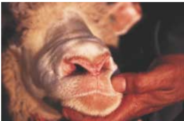
Fig. 5: Redness and crust formation of the nasal plane of an experimental case of Erodium moschatum photosensitisation.