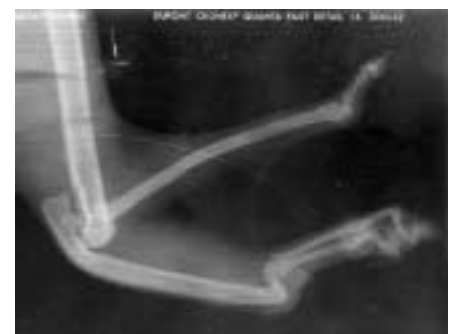
Fig 2: Lateral radiograph of the right forelimb of the cat. The radial component bears digit one and the ulnar component bears digits four and five.

A 4-year-old Boerboel bitch, born of registered parentage, was presented at the same veterinary practice and another apparent duplication of forelimb elements was observed. In this case, the