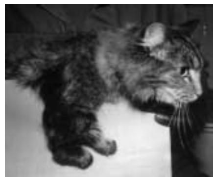
Fig 1: Photograph of the right forelimb of the cat.

digits of her left forepaw were deeply separated between the 3rd and 4th rays, and all 5 rays were visible externally (Fig. 3). The owners reported that she would shake this paw at first in the morning but would then walk and run quite normally.