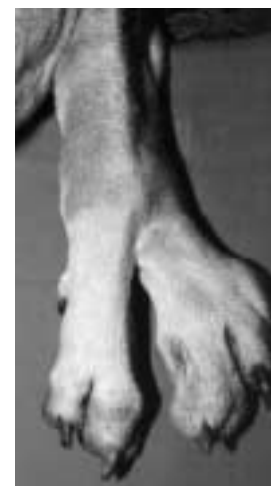
Fig 3: Photograph of the left forelimb of the dog.