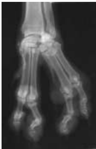
Fig 4: Lateral radiograph of the left forelimb of the dog. There is a deep cleft between digits 3 and 4, and a sixth digit along the axial side of digit 4.