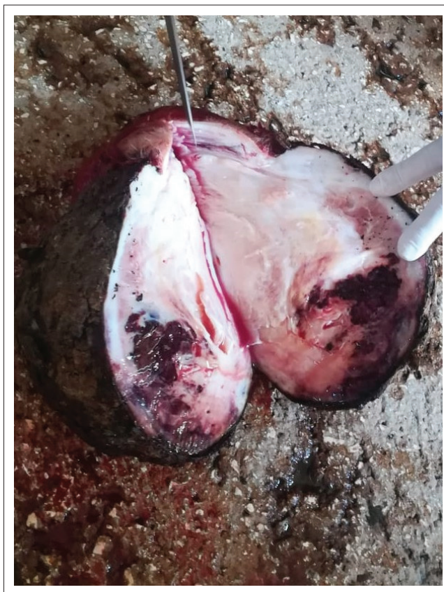
FIGURE 2: Cut section of the resected mass showing colour heterogeneity ranging from diffusely white to multifocally brownish areas and tinged with blood from haemorrhage in its central region.

The mass weighed 8 kg and was predominantly gelatinous and glistening when observed on the cut section, exhibiting colour heterogeneity ranging from diffusely white to multifocally brown and appearing tinged with blood from haemorrhage in its central region (Figure 2).